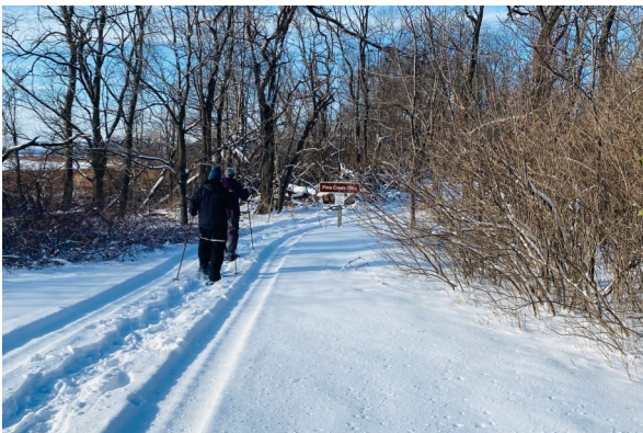
Snowshoeing at Pine Creek Dike